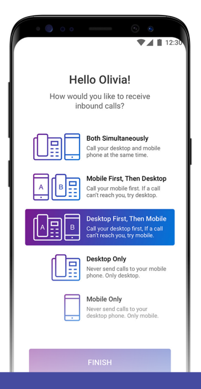
Calls on the Go